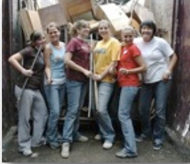
Volunteers helping at an inner-city facility

“Churches only exist for the sake of their members ...” That’s why, we were told, many foundations would rather support non-church agencies than the efforts of churches. All too often, this perspective rings true. How very far from Jesus’ radical self-giving for the sake of others!